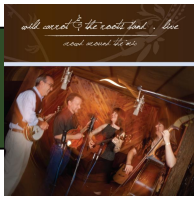
Crowd Around the Mic . Live

"This is an album that is simultaneously lovely, clever, and swingy...it's not predictable and is easily the most exciting bluegrass album I've heard since the last Crooked Still release."